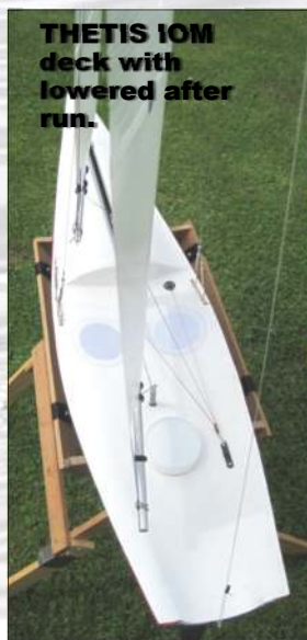
THETIS IOM deck with lowered after run.

Below, left: Nylet IOM yacht with the early dropped run GRP deck.